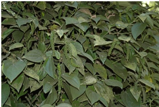
Black pepper-IISR Shakthi