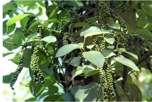
Black pepper-IISR Girimunda