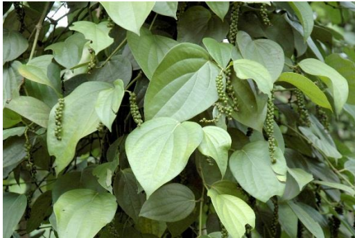
Black pepper-IISR Thevam