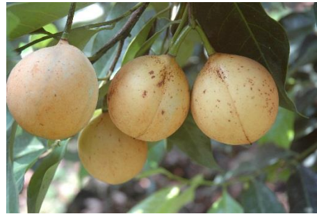
Nutmeg- IISR Keralashree