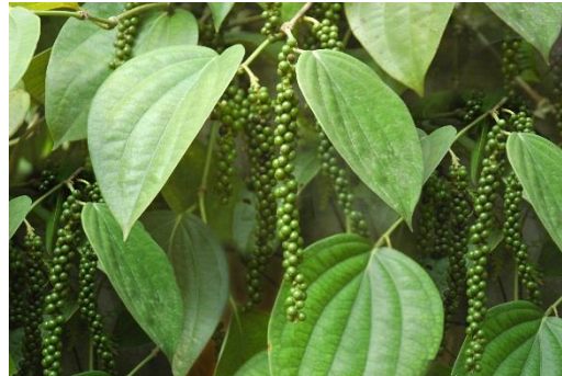
Black pepper-IISR Malabar Excel