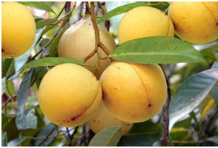
Nutmeg- IISR Viswashree