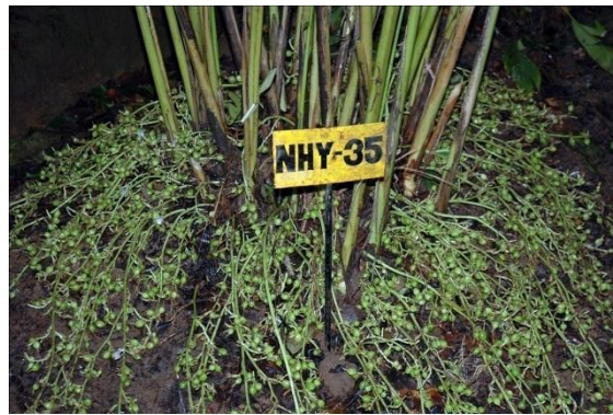
cardamom Appangala 2