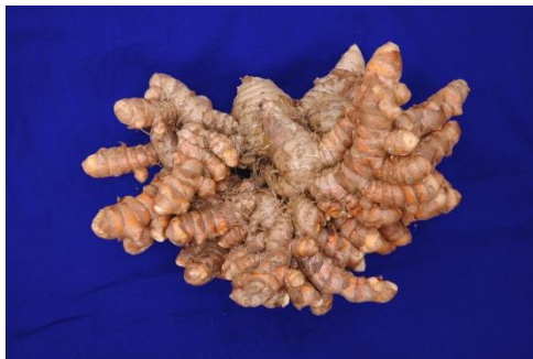
Turmeric-IISR Alleppey Supreme